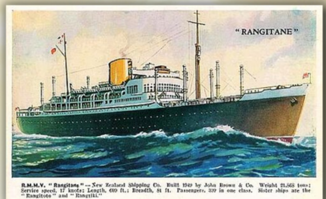
R.M.M.V. "Rangitane" -- New Zealand Shipping Co. Built 1949 by John Brown & Co. Weight 21,568 tons; Service speed, 17 knots; Length, 600 ft.; Breadth, 81 ft. Passengers, 329 in one class. Sister ships are the "Rangitoto" and "Rangitiki."